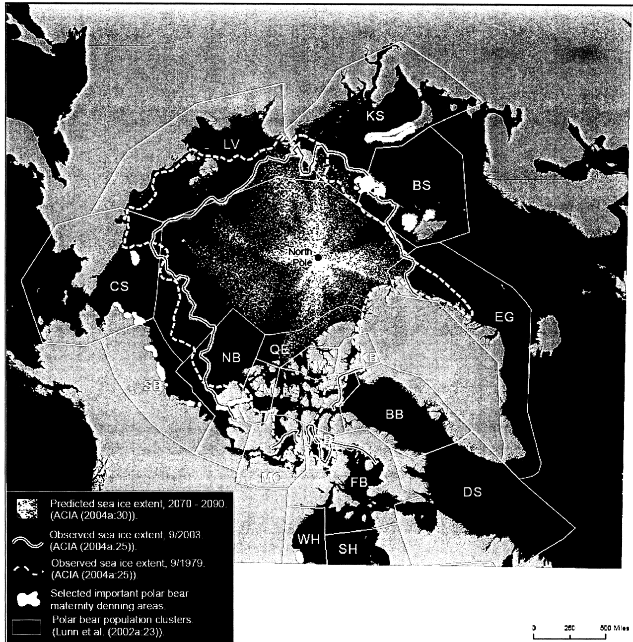
Figure 2. Selected Polar Bear Terrestrial Denning Areas Compared to Past, Present, and Predicted Future Summer Sea-Ice Extent

Polar Bear Population Abbreviations. CS = Chukchi Sea; SB = Southern Beaufort Sea; NB = Northern Beaufort Sea; QE = Queen Elizabeth Islands; VM = Viscount Melville Sound; NW = Norwegian Bay; LS = Lancaster Sound; MC = M'Clintock Channel; GB = Gulf of Boothia; FB = Fove Basin; WH = Western Hudson Bay; SH = Southern Hudson Bay; KB = Kane Basin; BB = Baffin Bay; DS = Davis Strait; EG = East Greenland; BS = Barents Sea; KS = Kara Sea; LV = Laptev Sea; Arctic Basin is the unlabelled area centered on the North Pole