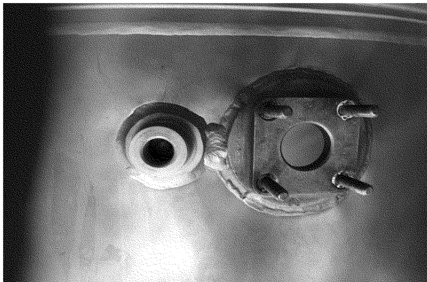
Figure 2 to Paragraph (g) of this AD. Combustion Chamber Case Assembly with One-Piece Bleed Pad with P3 Boss